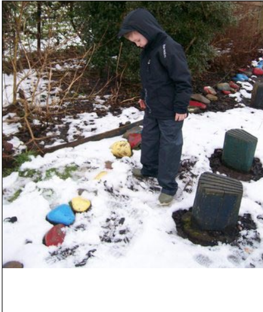
Feeding the birds in the snow of January 2010.