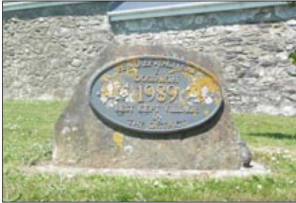
The plaque awarded to the best kept village in the district 1989