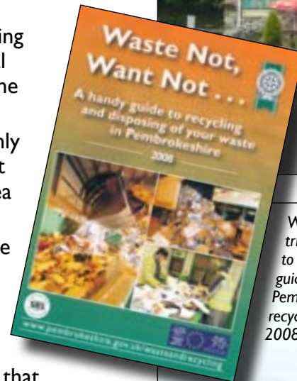
Wolfscastle tries hard to follow the guidance in the Pembrokeshire recycling guide. 2008