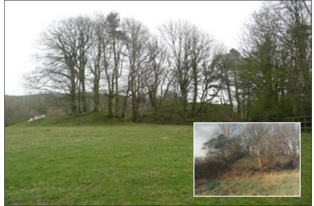
The Motte and Bailey before it was taken over by the community ... ...and now 2010