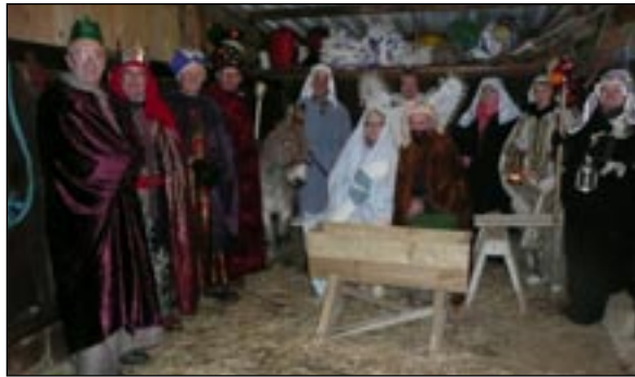
Penybont Chapel Open Air Nativity which attracts hundreds of spectators from near and far each December. This was the 2009 cast.