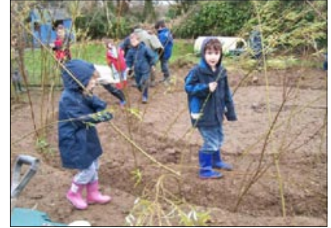
The Willow Maze is one of the fascinating features of the school garden. It was put together in 2009 with funding help from the school's Parents & Friends. 2009