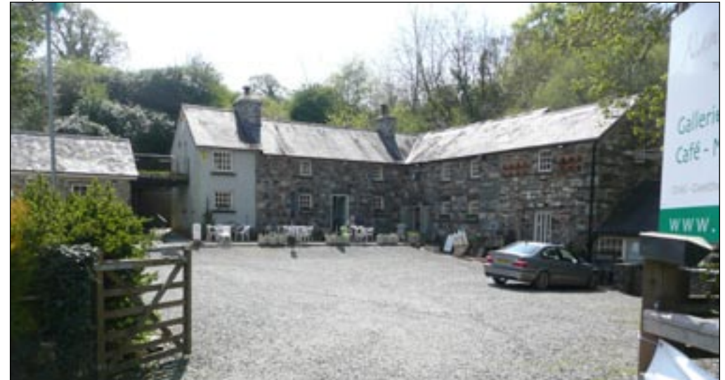
Nant-y-Coy Mill, extensively restored and now a gallery, restaurant, art workshop, mill water wheel and farm shop. 2010