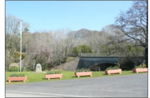
Riverside Amenity Area as it looks today. July 2010

• Helping to preserve the village's attractive environment is the Working Group's Policy on litter and dog-fouling as well as graffiti. A zero tolerance approach has been adopted but rarely has to be enforced. Villagers setting good examples often do enough to ensure that problems seldom arise.