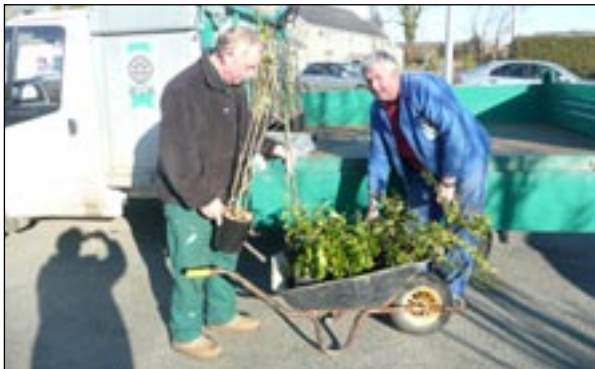
Members of the Pembrokeshire County Council workforce delivering plants provided under the Tidy Towns Scheme. March 2010