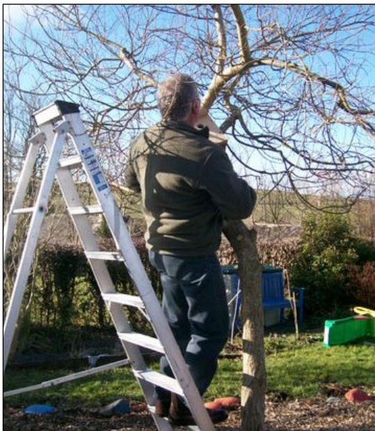
Erecting bird boxes March 2010.