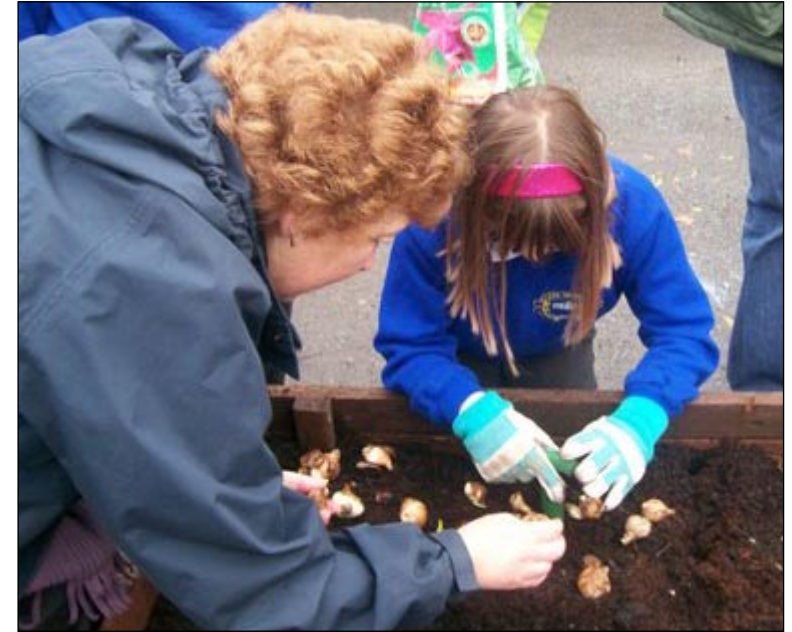
Planting Spring bulbs October 2009