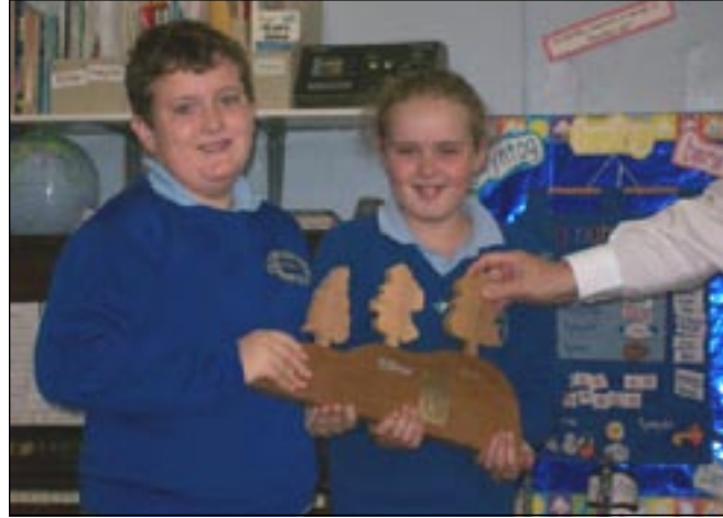
Wolfscastle School receives its Gold Award in the county's sustainable school awards September 2009