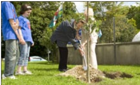
Wartime evacuees returned to Wolfscastle to plant commemorative trees on the village green to mark 175 years of the village school in July 2009

• Giving Wolfscastle its charming and serene character is the open valley of the Western Cleddau which runs into the heart of the village under the two-arched bridge and alongside the village green and its Millennium centrepiece.