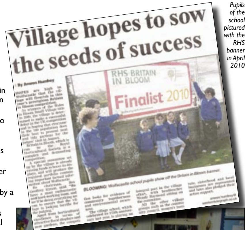
Pupils of the school pictured with the RHS banner in April 2010