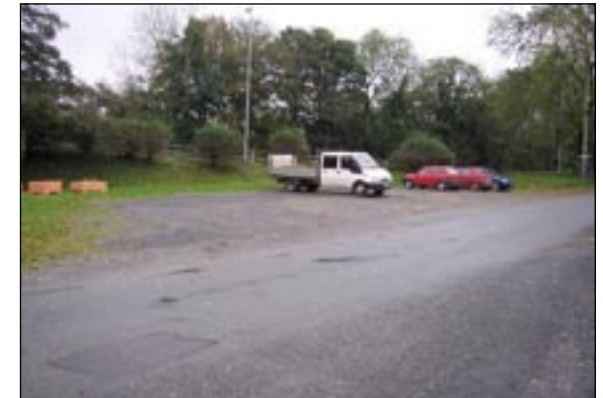
Riverside Amenity Area before the work of resurfacing 2009