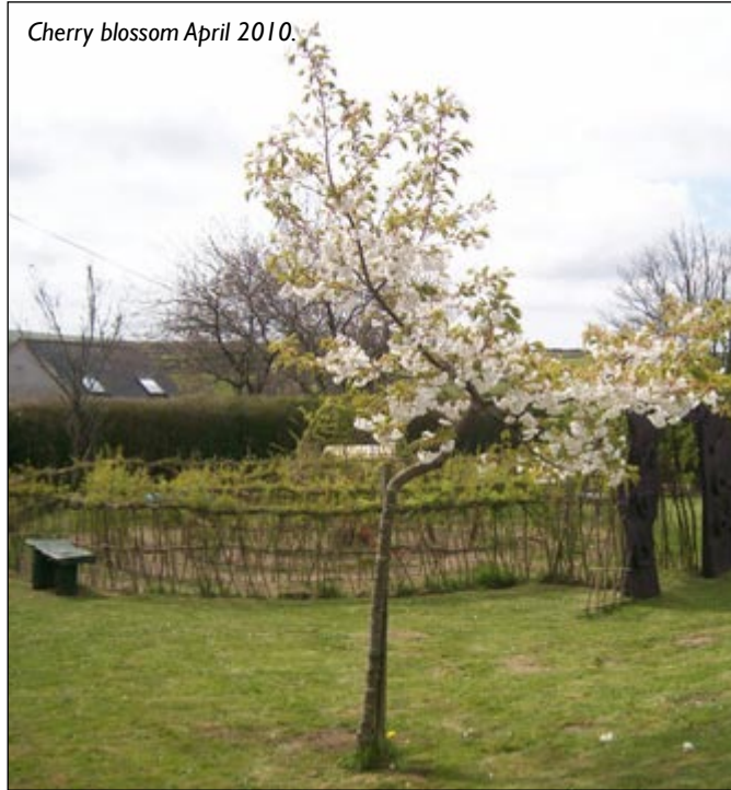
Cherry blossom April 2010.